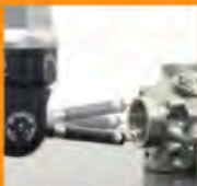
PH20 5-axis touch-trigger system

OVER 40 YEARS OF BREAKTHROUGH INNOVATION